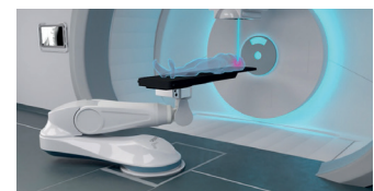
3D Presentation of Robots