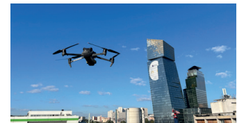
Report Drone tours Duo